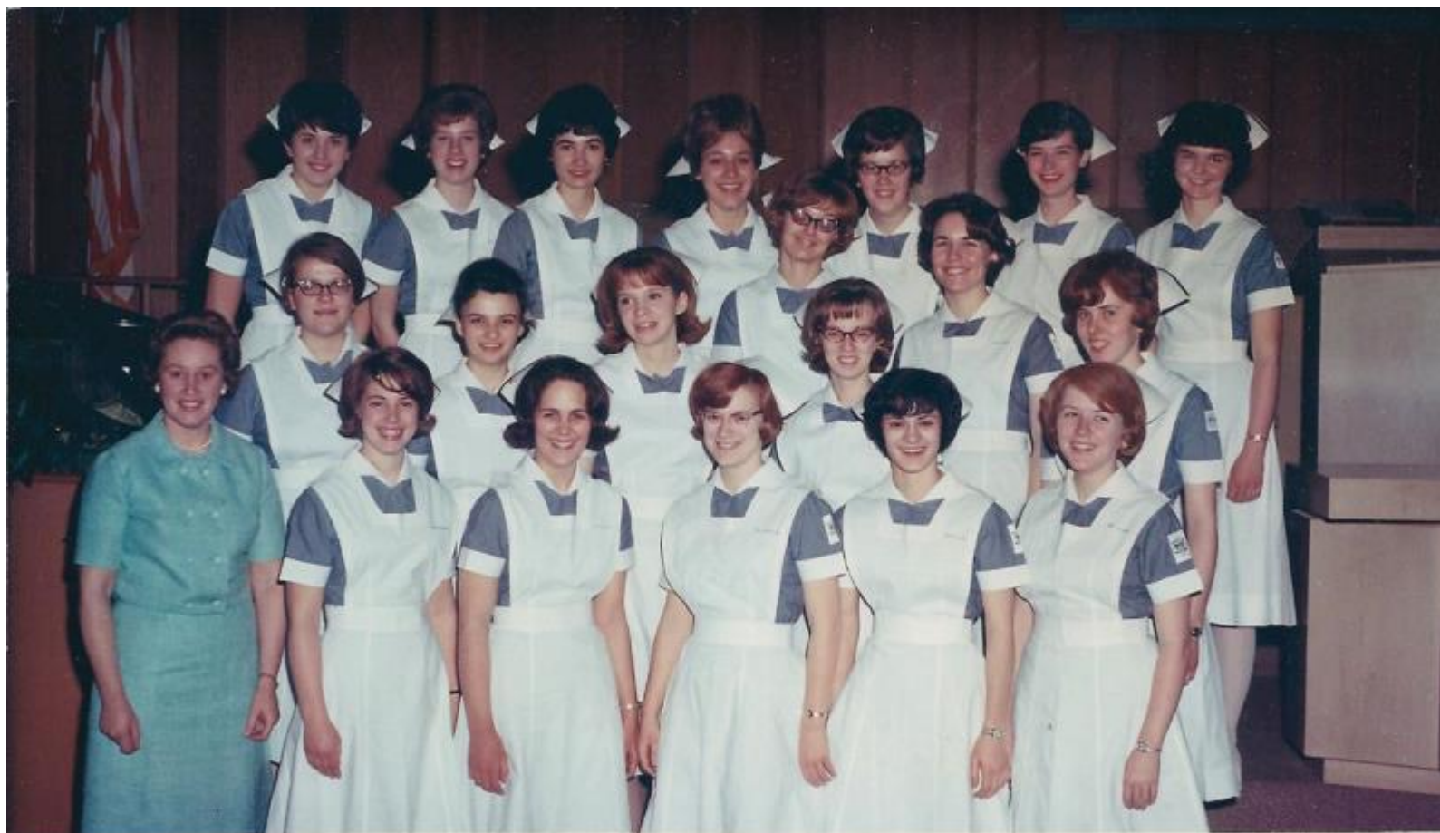
WEST SUBURBAN HOSPITAL SCHOOL OF NURSING VOCAL ENSEMBLE